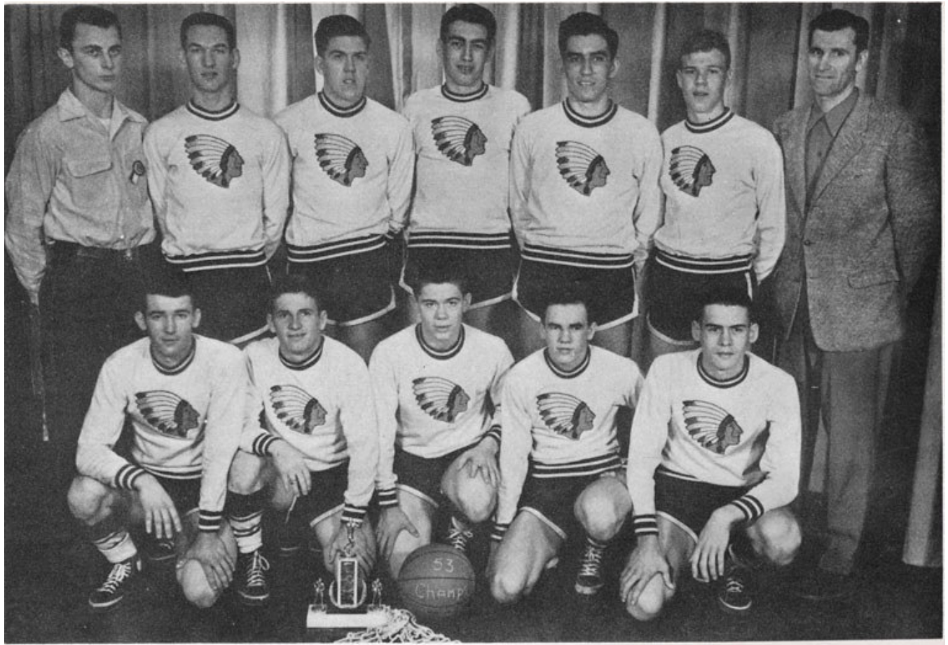
Shown is the Montezuma basketball team with the Wabash Valley Preliminaries trophy which they won. In addition, this group of boys won the Parke County Conference, the sectional, and placed first in the Western Indiana Conference.