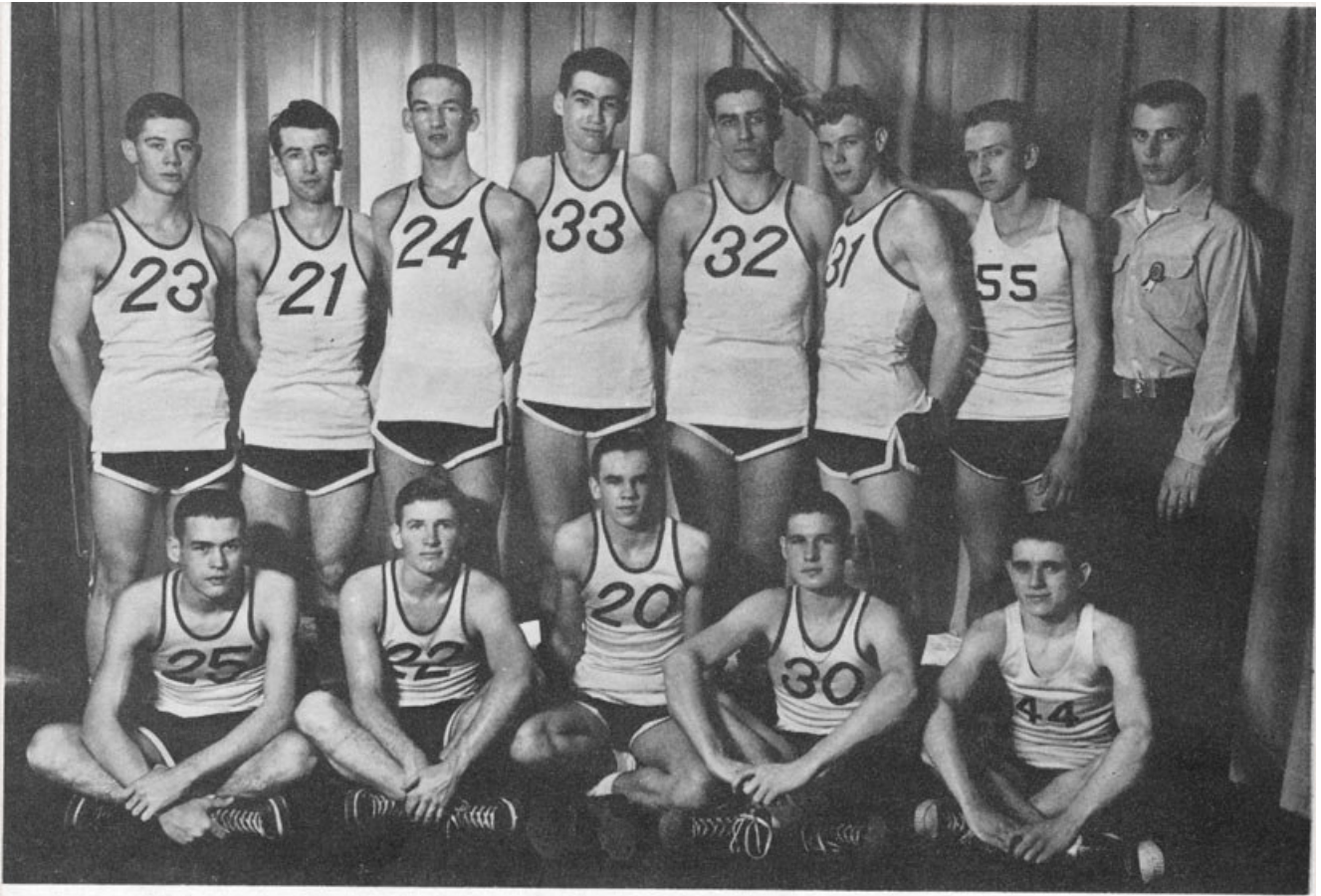
At the printing of this annual the track season had just arrived. All indications are, though, that Monte will make a good showing in the county track circles.