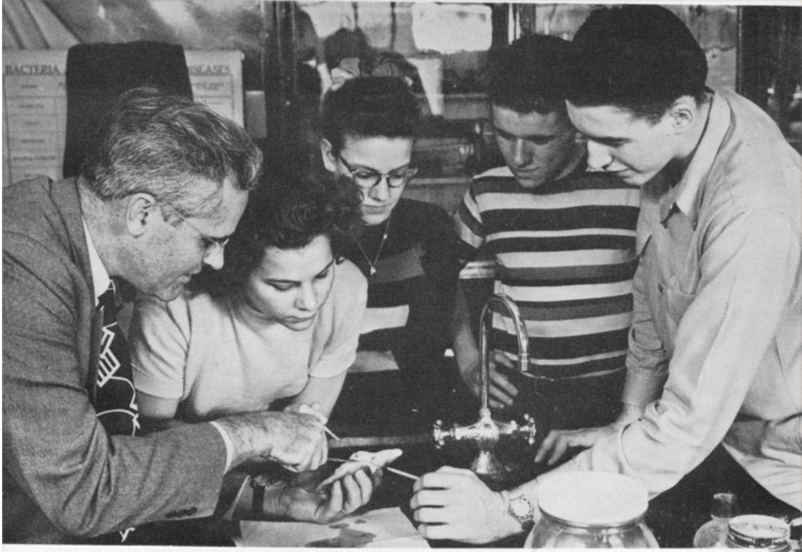
A group of sophomores learning to recognize the parts of a fish.