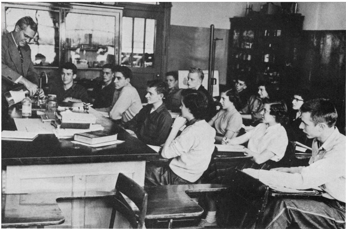
A group of junior and senior students learning the test for the presence of protein in Chemistry class.