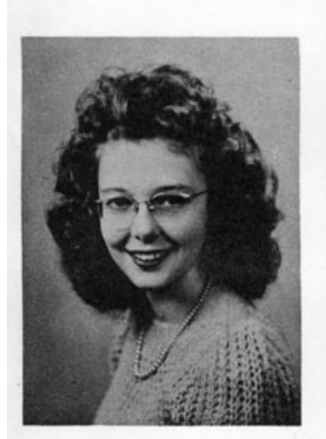
Cute, smart, and a little small, but what boy wants a girl to be tall,