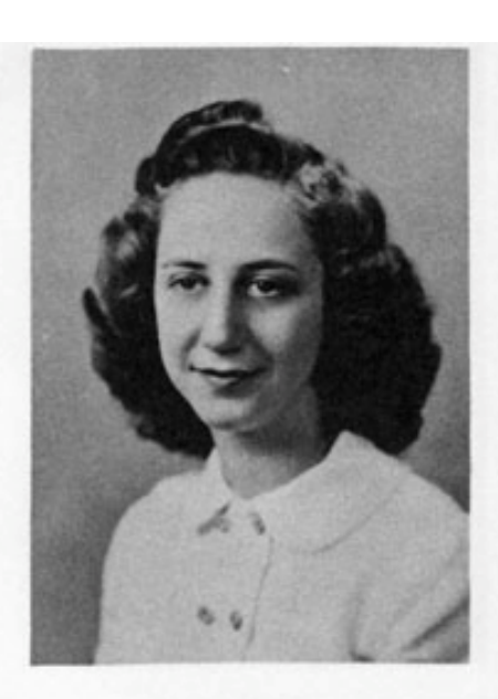
The bombshell of M. H. S., when she lets go, look out.