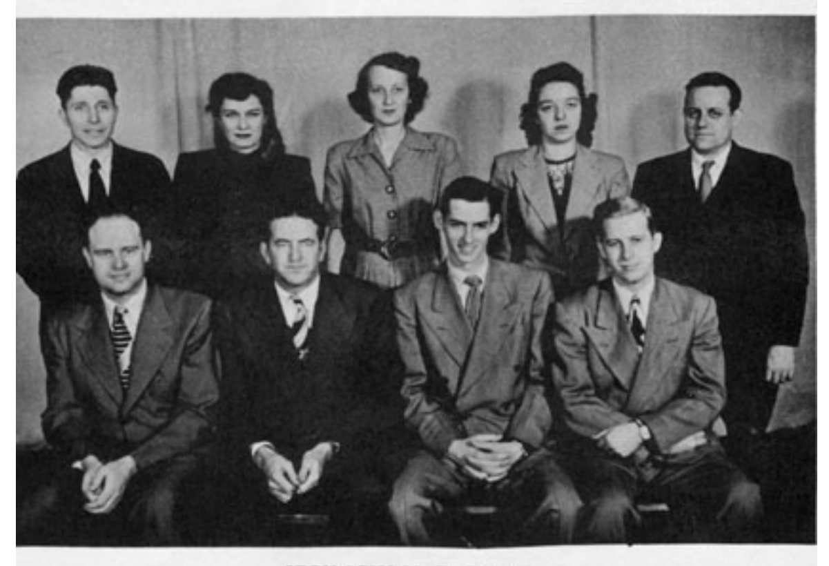
HIGH SCHOOL FACULTY