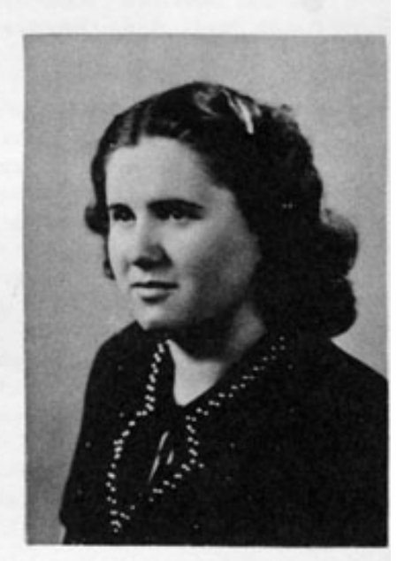
The best editor in the Senior Class.