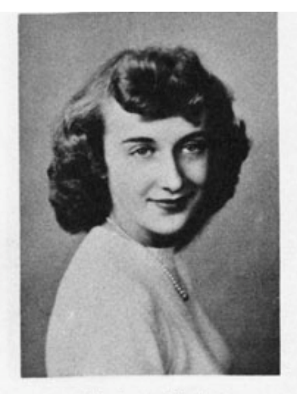
She's short and blonde, and not much bigger, but she buys clothes, that gives her a figure.