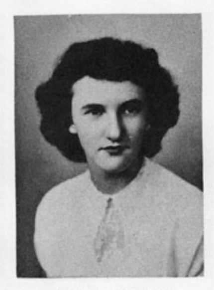
The old woman in the shoe, she met the boys, and knew what to do.