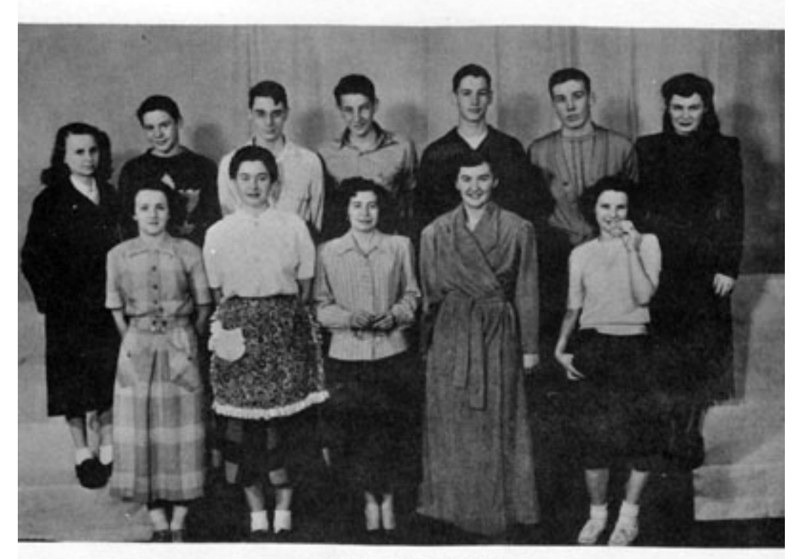
JUNIOR CLASS PLAY "DARLING BRATS"