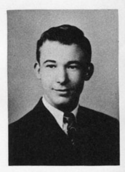
Cute, red headed, and not very big, but dynamite comes in small packages,