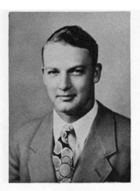
Too many girls have I,