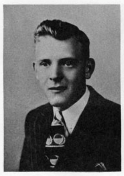
Strong voice, weak mind, when it comes to singing, we're left behind.