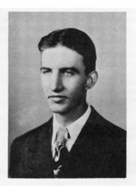
Life can be beautiful, why can't I?