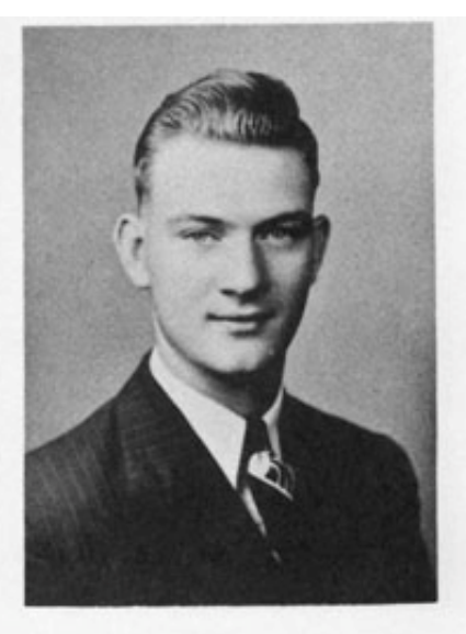
He's on the alert, when it comes to a skirt,