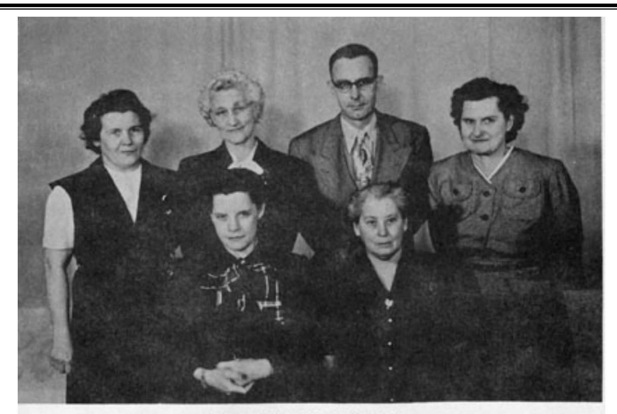
GRADE SCHOOL FACULTY