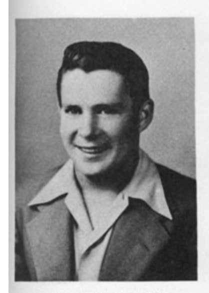
The most representative Senior of our class, most likely to succeed,