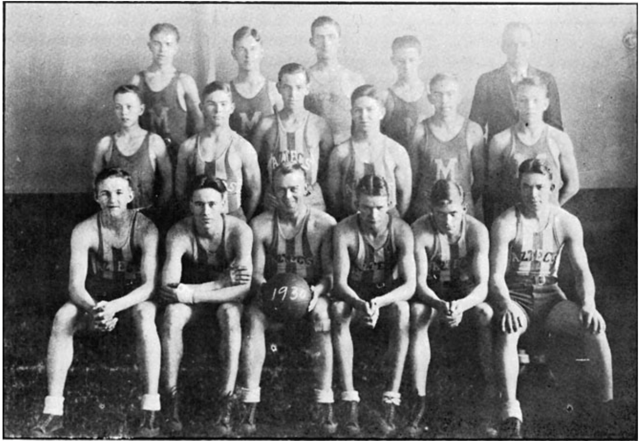
Basket Ball of 1929-30