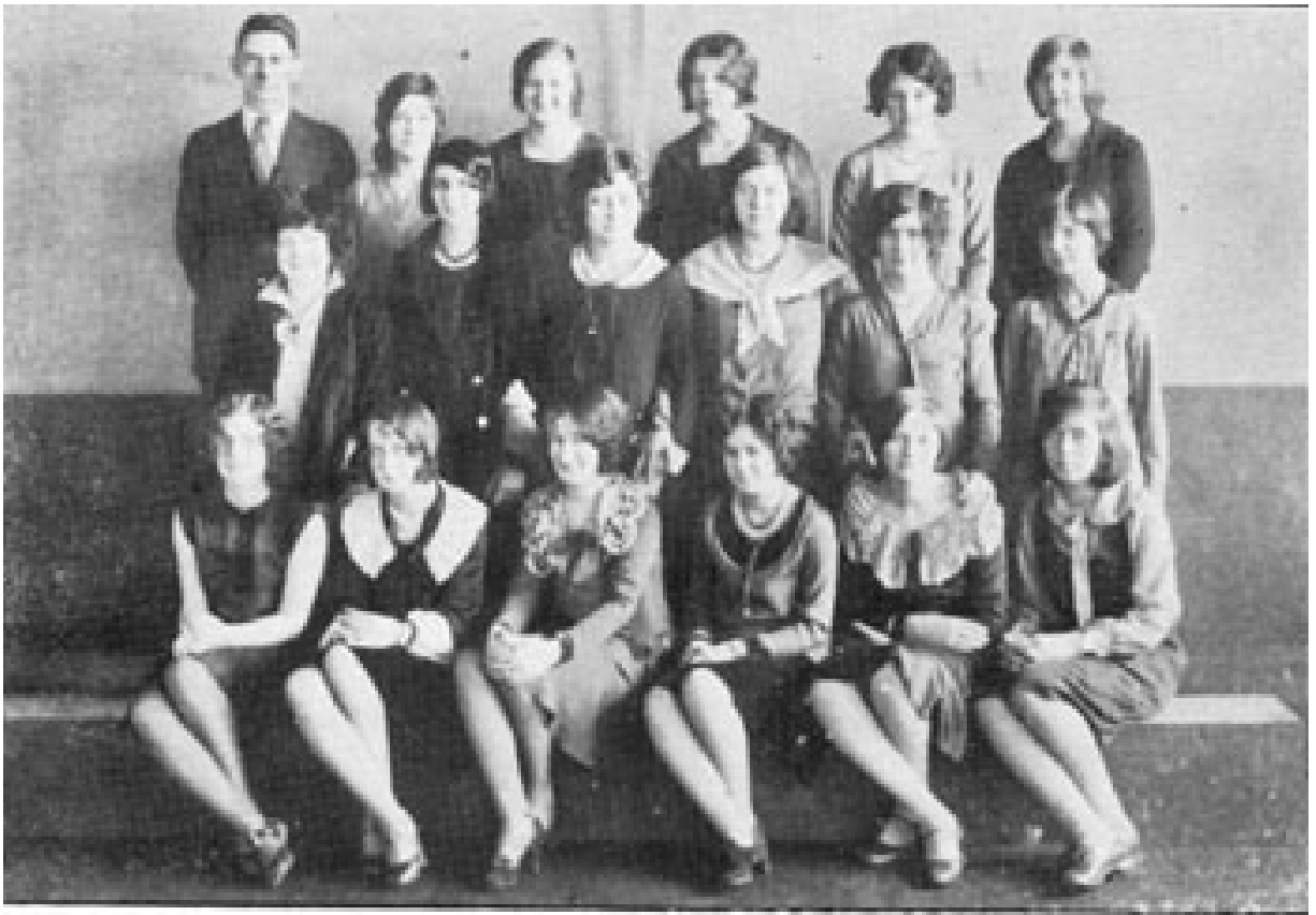
The Student Office Force