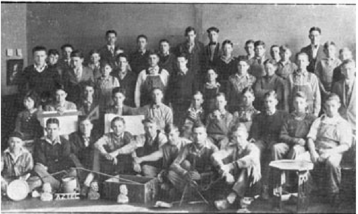
The Industrial Arts Department