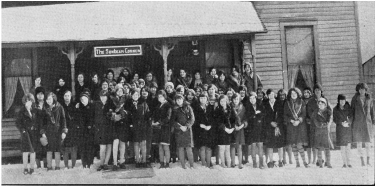
The Future Homemakers