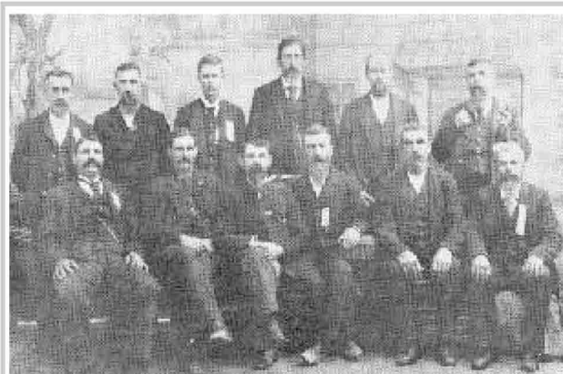
Civil War Veterans of the 51st Ind. Vol. Reg.