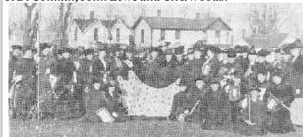
The War Mothers of Kentland. Date unknown.

Note: these photos were reproduced from the Kentland Centennial Book, 1960.