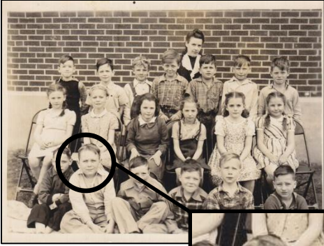
Lake Village School