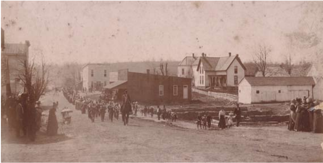
Decoration Day in Nashville, ca. 1900 Looking west down Main Street

the trees. Some of the animal hides were procured from local people, but many were shipped to the tanneries from other states. The hides were then hauled to and from the railroad depots by wagon.