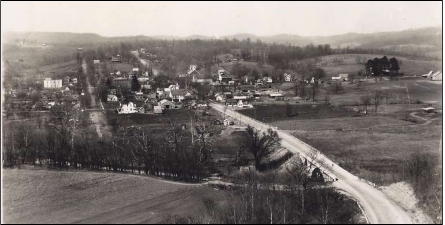
Nashville looking North from Town Hill 1934

(By Frank Hohenberger as published in "Brown County's Art Colony, The Early Years.")