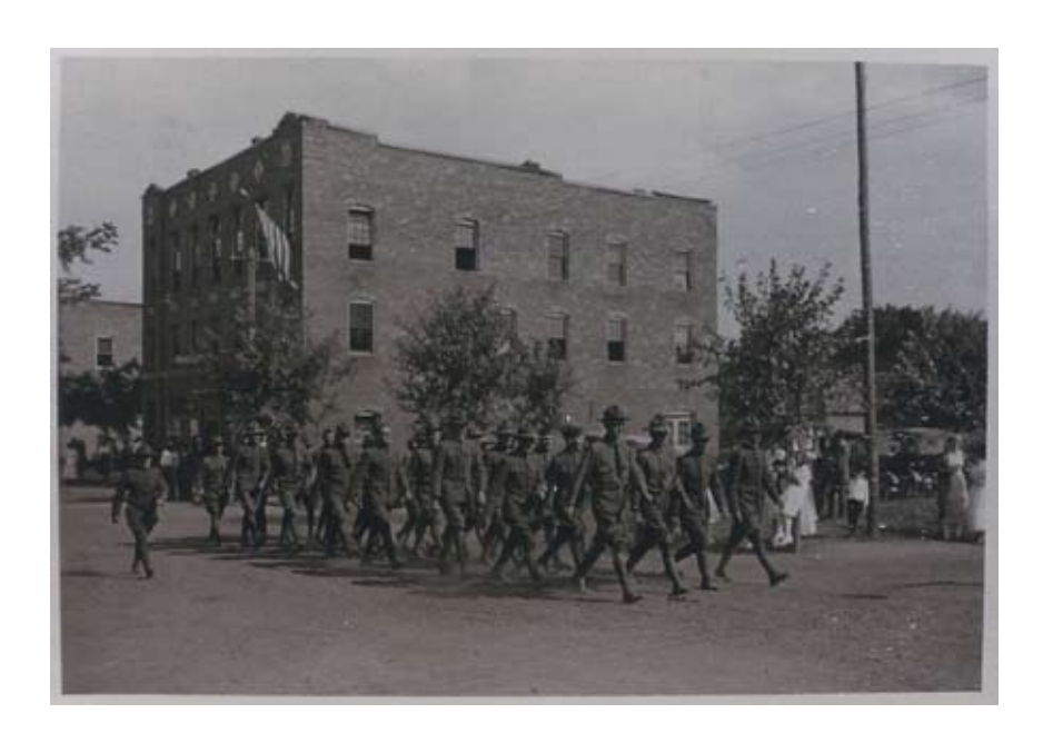
World War 1 Veterans Returning Home - 1918

Walking up the hill you notice many, many unmarked fieldstones lying scattered on the ground, some partially buried, some may be totally buried by now since it has been over 150 years since they were placed there. It is a rocky hill so sometimes it is hard to tell the fieldstones that mark a grave. The closer we get to the top the stones get more numerous and many more are well-carved monuments to someone's family member. Generally the three cemeteries are split in three uneven plots with the Calvin Cemetery being at the top. The Southview is like it is described in that it looks south down the hill more towards Nashville. The Oakhill portion is hard to tell where it starts and Southview ends and both are on the slope of the hill which ends at the bottom at Jackson Branch Creek.